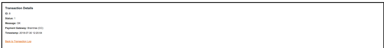
Figure 3: Transaction Details

To view details of a particular transaction, select the transaction from the list.